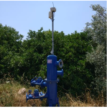
Handling & monitoring of the system via mobile devices

All the systems communicate with the center wirelessly, without any service subscription fee. They are self-powered, using small solar panels. The network is expandable and accepts and manages up to 5.000 measuring points (discharges). Apart from discharges, accepts data from the meteorological stations of the area and accepts data from boreholes and canals, of water quality and quantity.